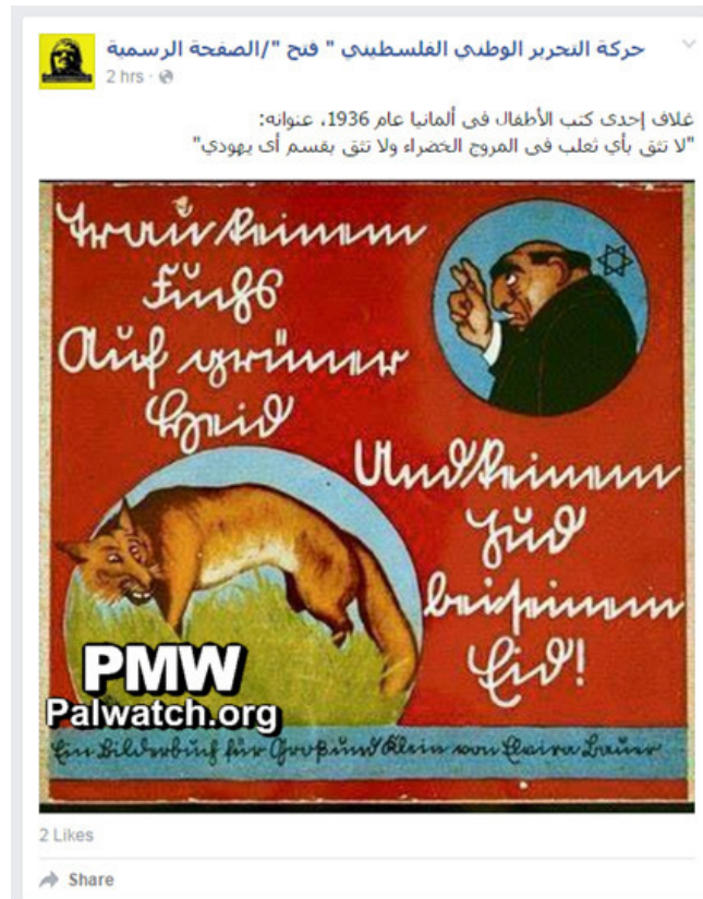
Image and text posted to official Facebook page of the Fatah Movement on Oct. 29, 2015

The image shows the picture of the cover of a children's book from Germany from 1936 with the title: "Trau keinem Fuchs auf grüner Heid und keinem Jud bei seinem Eid"