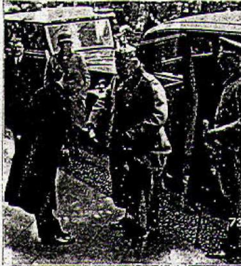
Note the subservience of Hitler's bow.

(iii) Heiden: In the midst of the Munich Putsch Hitler exclaimed to Kahr in a hoarse voice: "Excellency, I will stand behind you as faithfully as a dog!"