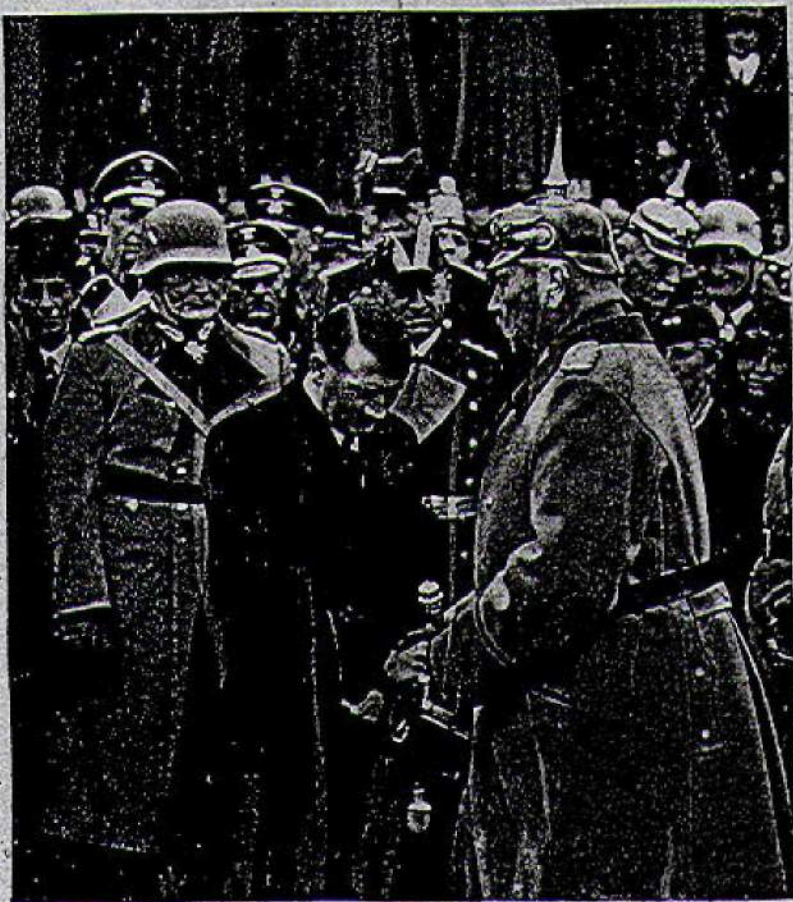
Hitler and President Hindenburg on the Day of Potsdam March, 1933

(ii) Strasser: Hitler's attitude towards the General was obsequious; he was in agreement with everything Ludendorff said.