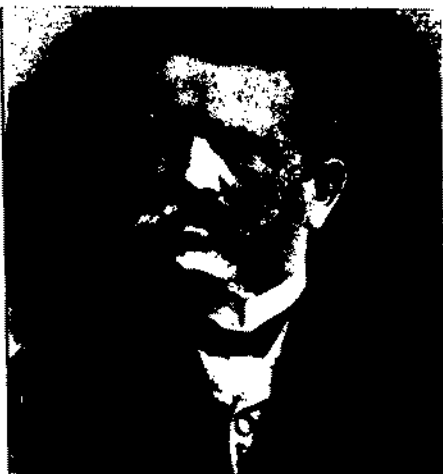
Alois Hitler -- Hitler's father. Note resemblance to Hindenburg.