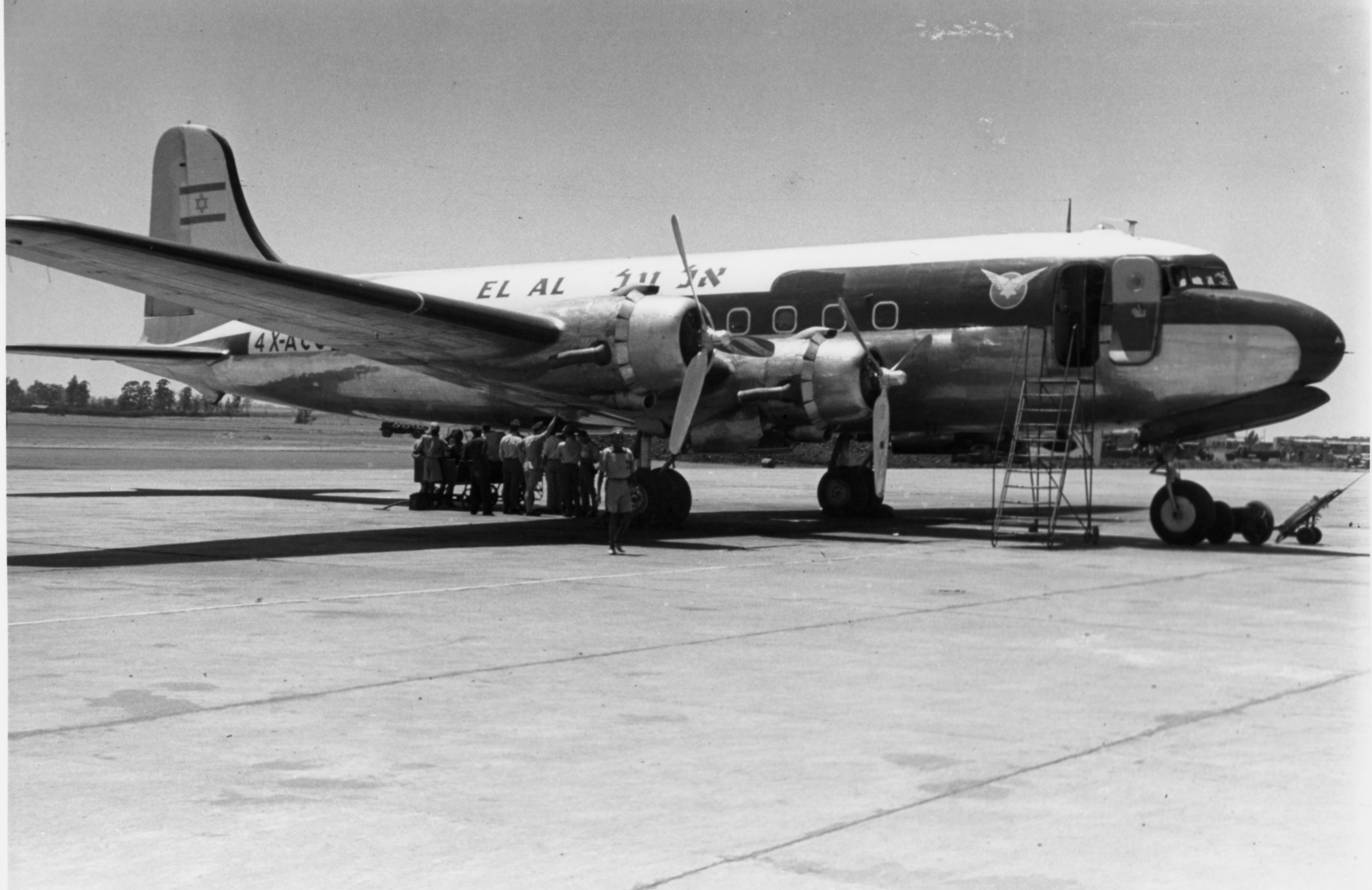
The first EL AL purchased aircraft, a Douglas DC-4, Israeli registration 4X-ACC, acquired in March of 1949.