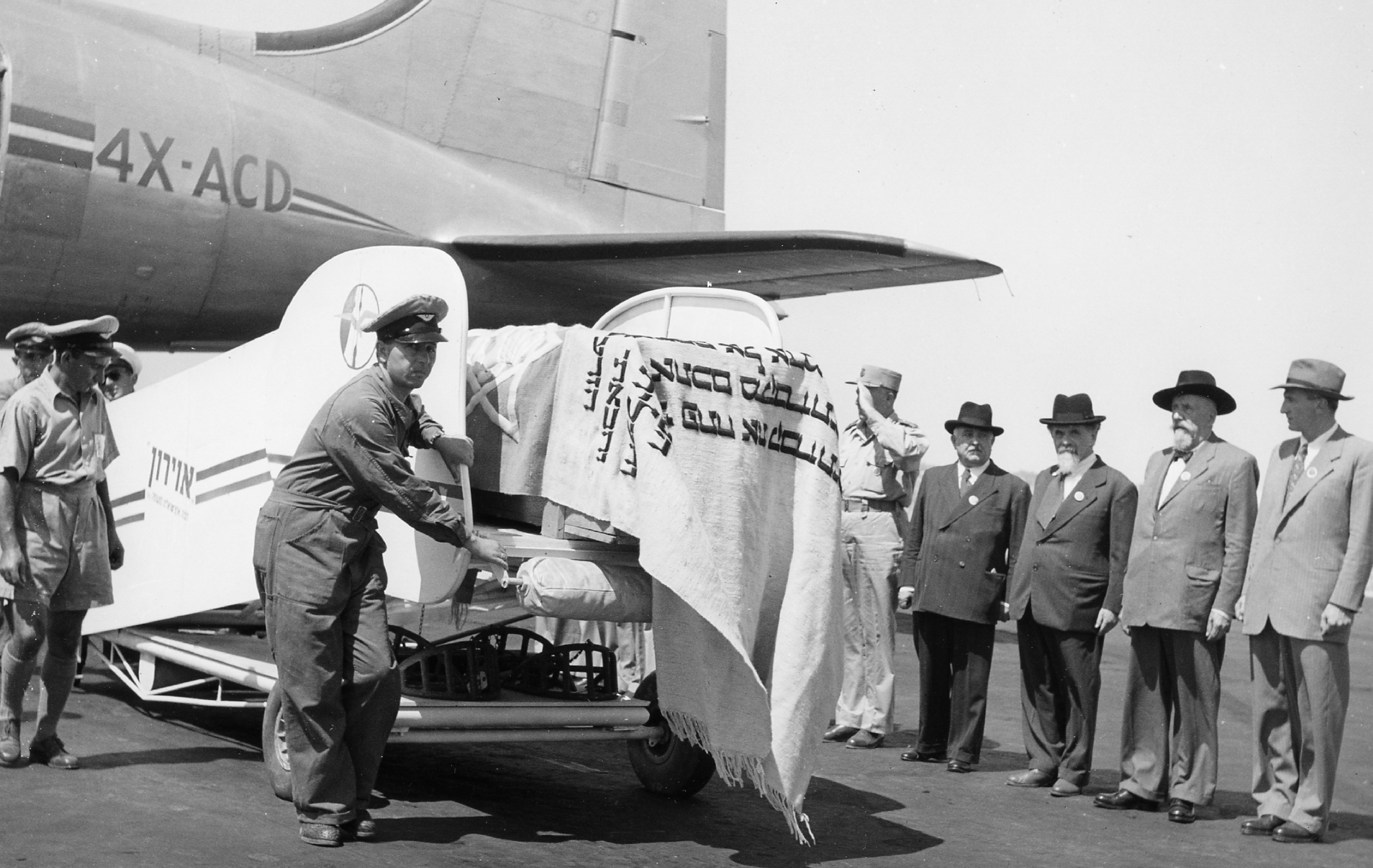
The draped coffin of Theodor Herzl arrives in Tel Aviv at Lod Airport (now Ben Gurion), having been carried to Israel aboard an EL AL special flight from Vienna on August 16, 1949.