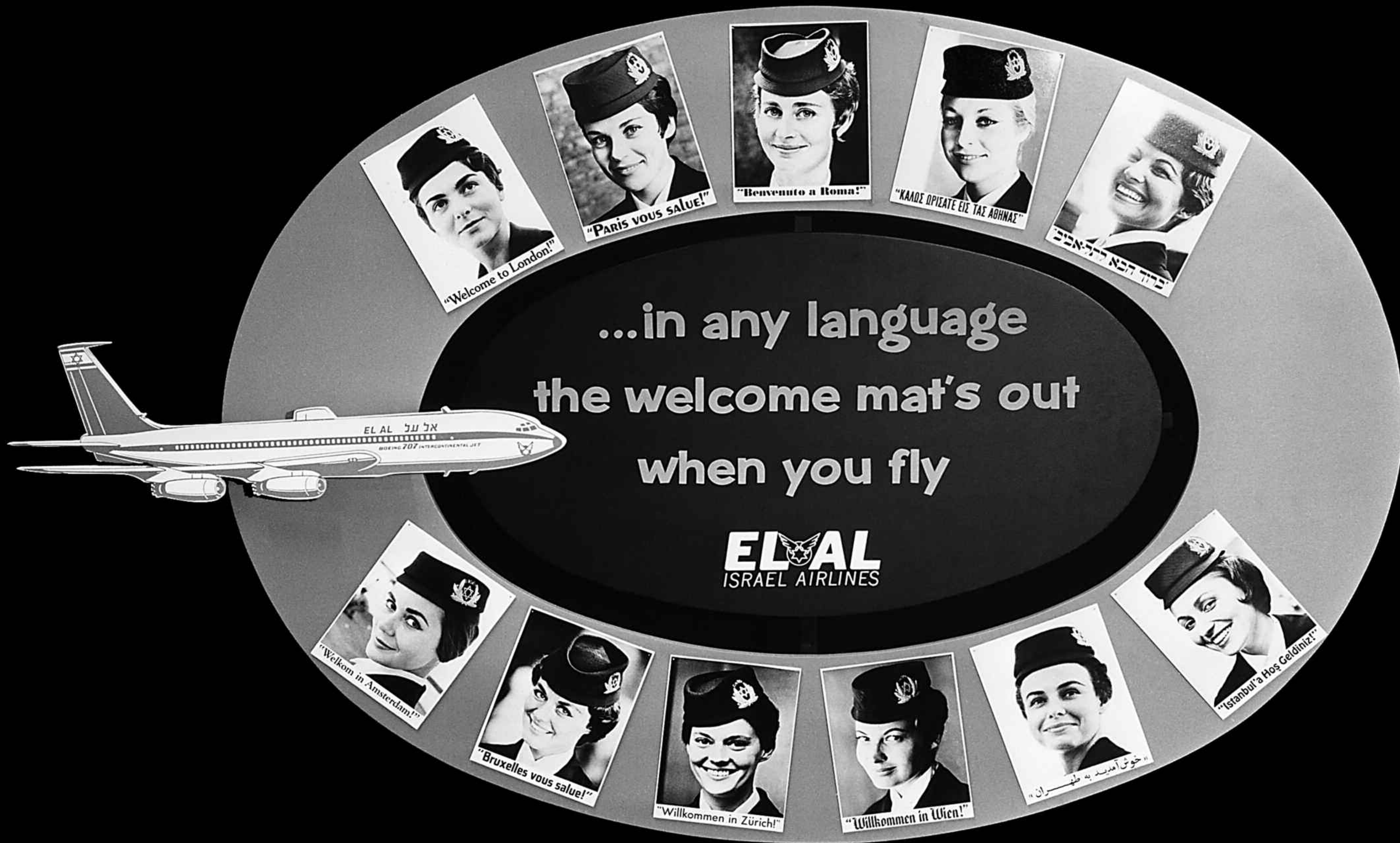
EL AL offices in the 1960s were typically located on the street level and featured many beautiful window displays. This display element features EL AL flight attendants from many of its country destinations.