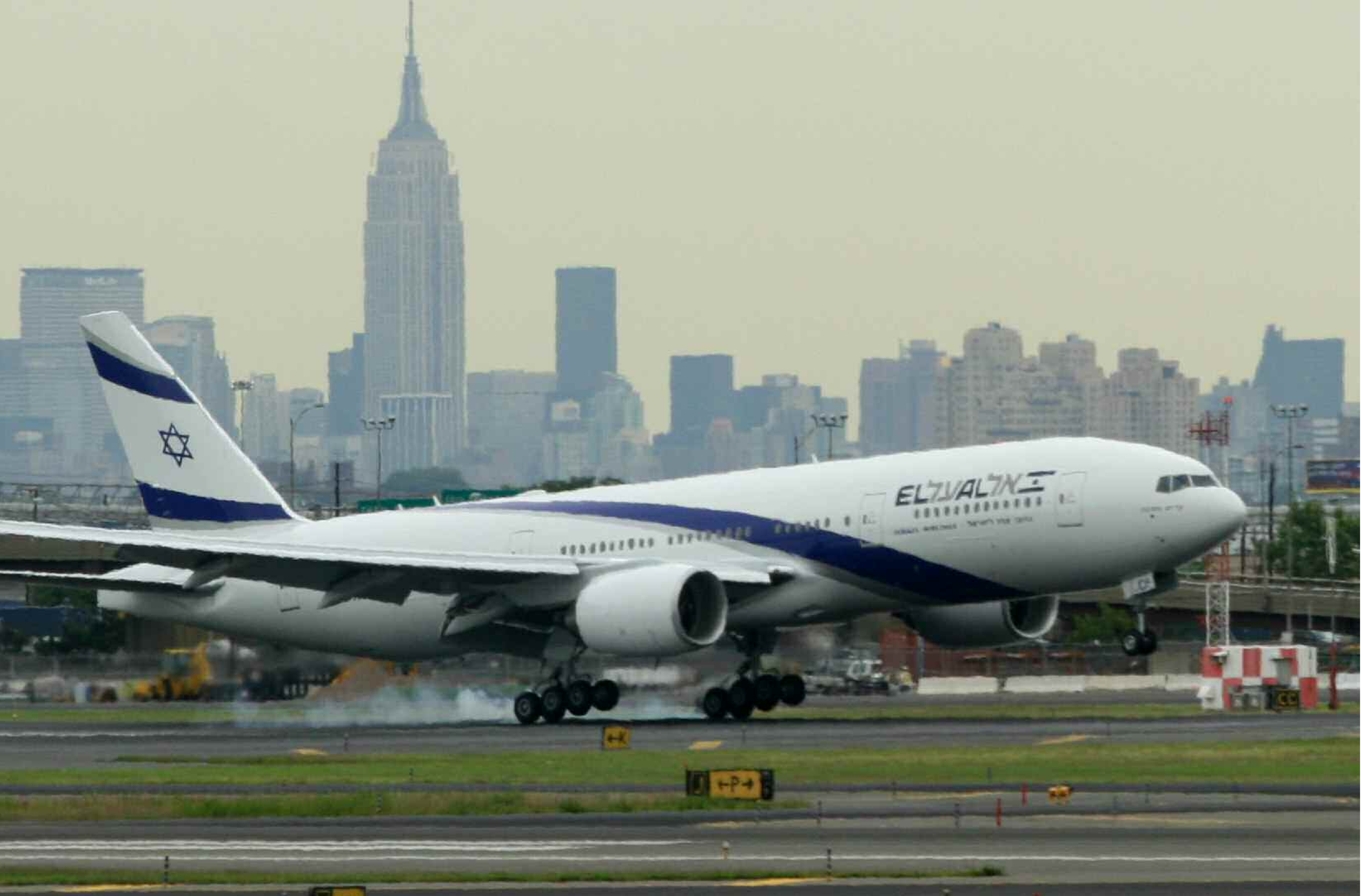
The new EL AL Boeing 777 aircraft named Kiryat Shmona, an Israeli border city in the north, landing at Newark Liberty International Airport in 2007 with New York's Manhattan skyline in the background.