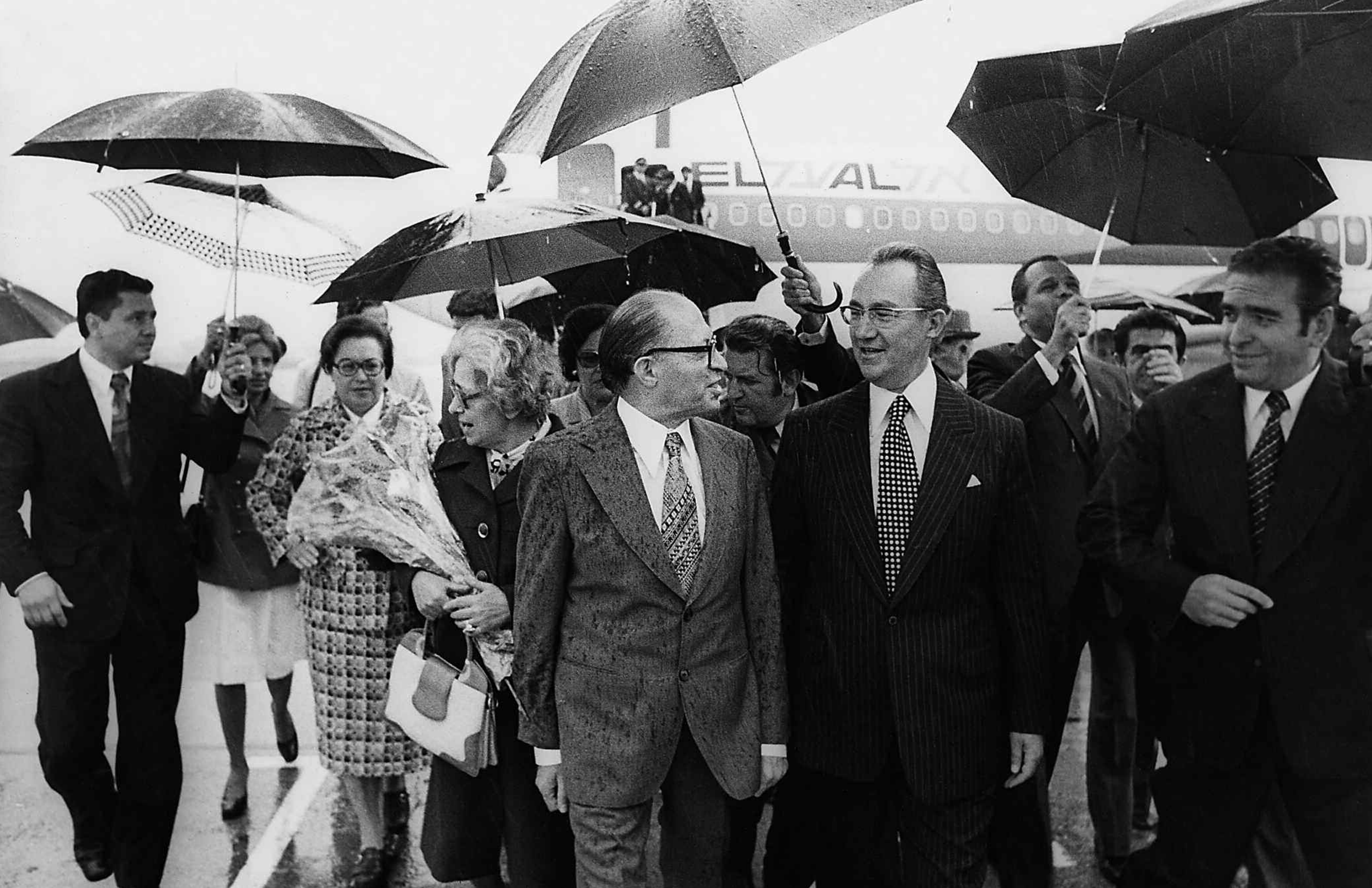
Menachem Begin, Prime Minister of Israel from 1977 to 1983, returning to Ben Gurion Airport from one of his frequent trips abroad on EL AL in the late 1970's. To his left in the photo is wife Aliza.