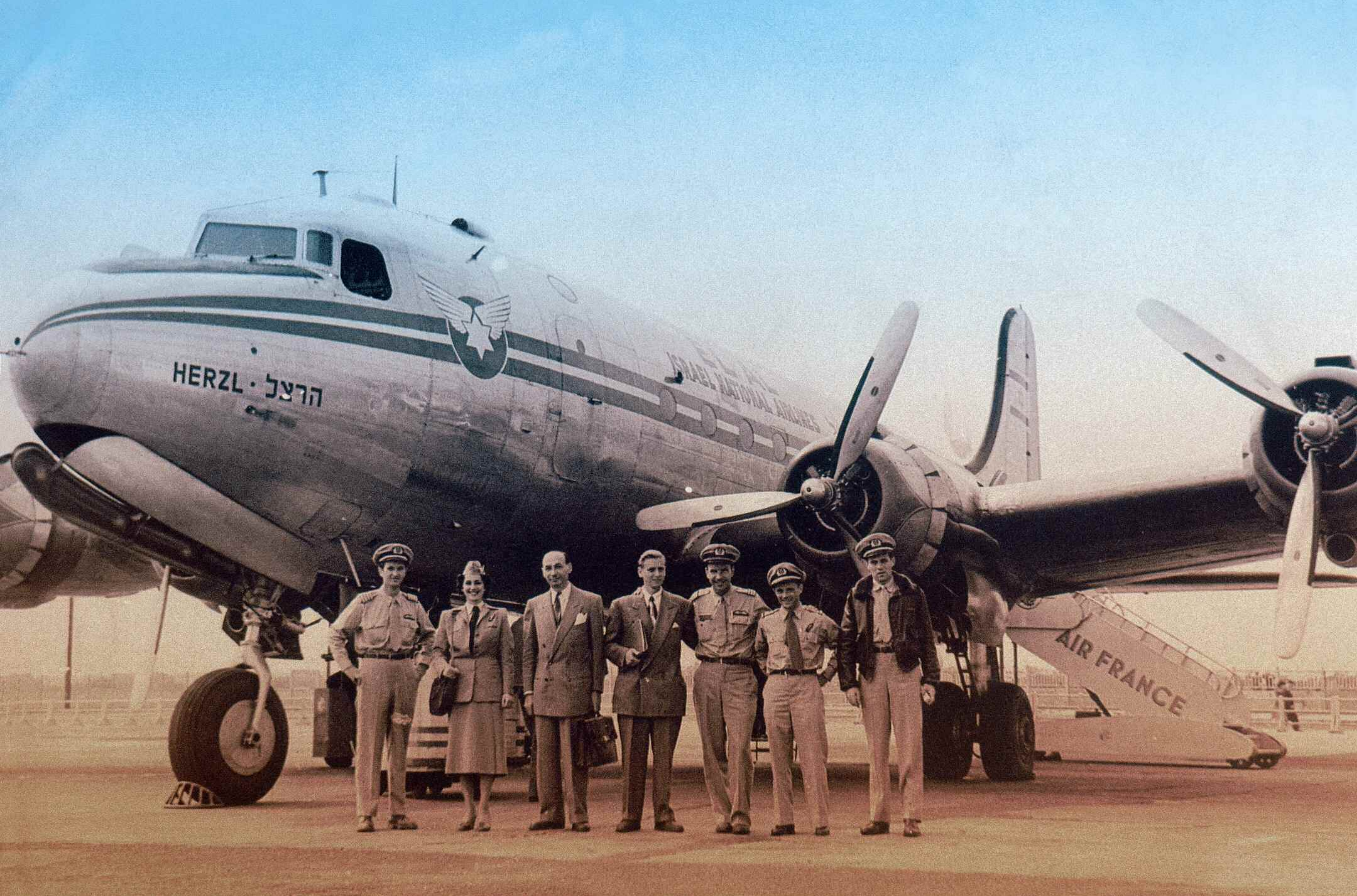
First EL AL scheduled passenger flight (July 31 – August 1, 1949) arrives at Orly Airport, Paris following a flight from Tel Aviv via Rome.