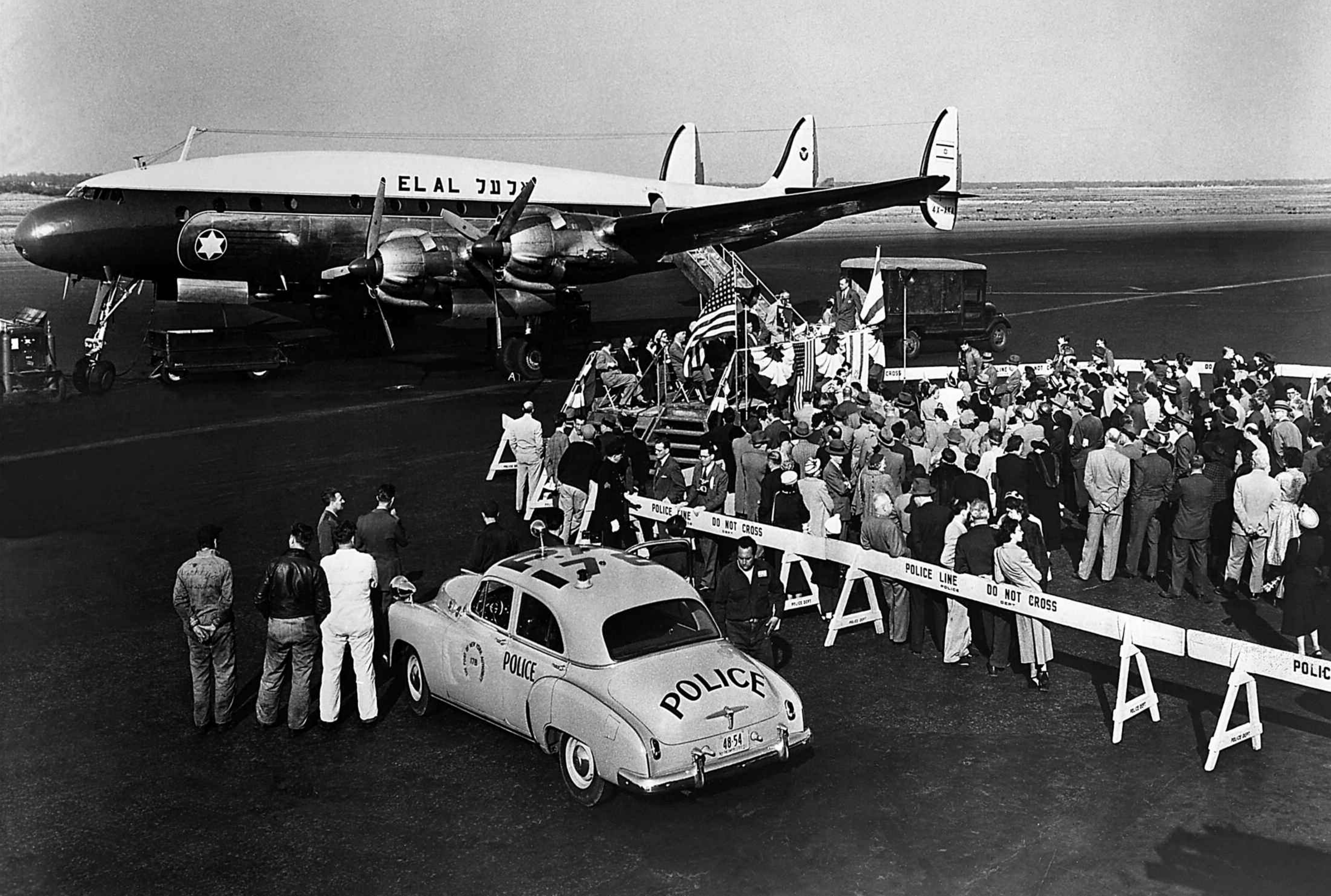
Welcome reception hosted by the City of New York at Idlewild Airport (now JFK) upon arrival of the first scheduled EL AL flight to the USA using a Lockheed Constellation aircraft. May 1, 1951.