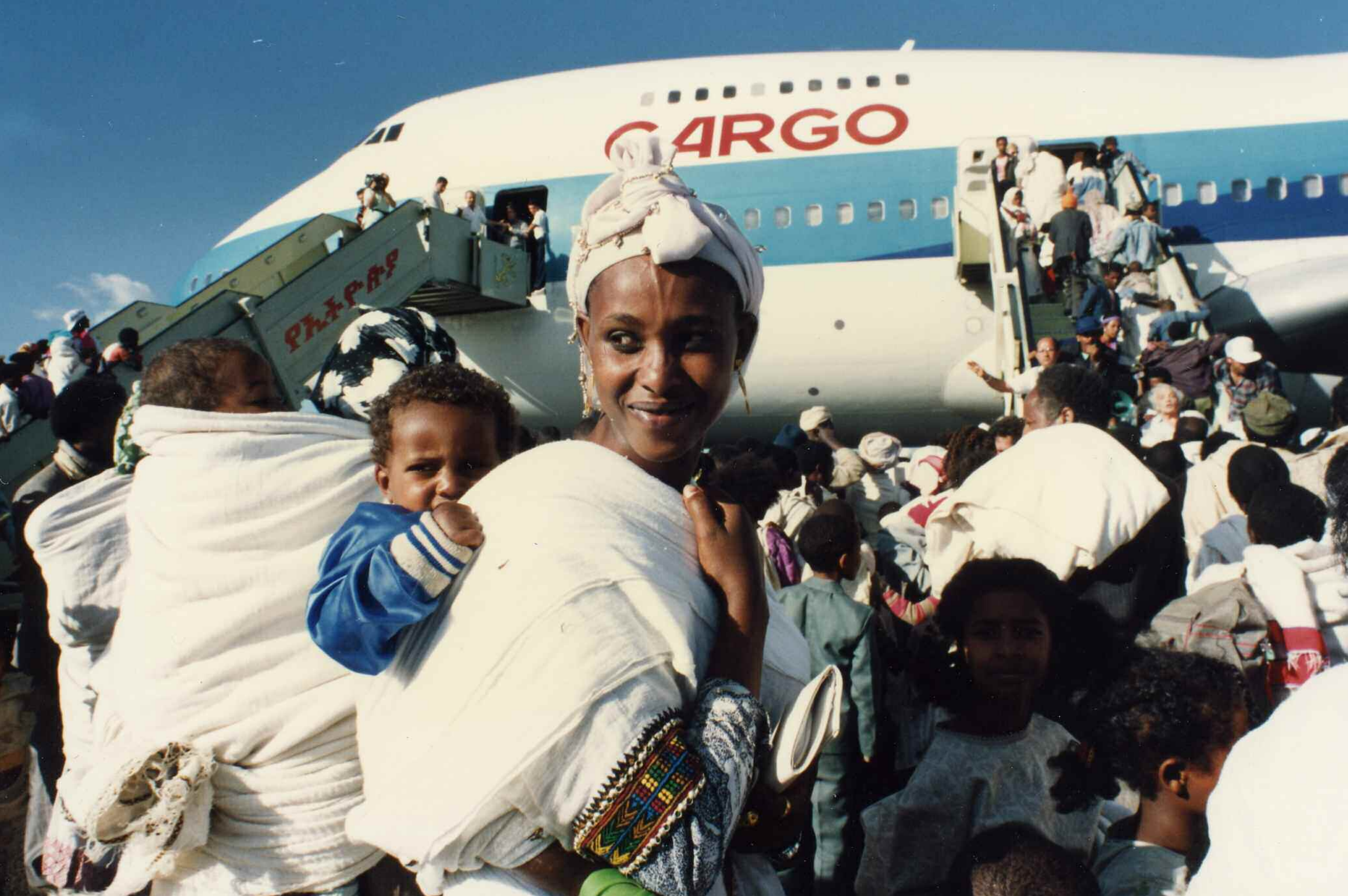
...Boarding an EL AL 747 aircraft in Addis Ababa, Ethiopia during the Operation Solomon airlift on May 24, 1991 in which 14,000 Ethiopian Jews were rescued and brought to Israel. The aircraft shown carried 1,087 persons, an all-time record for the most passengers on any plane.