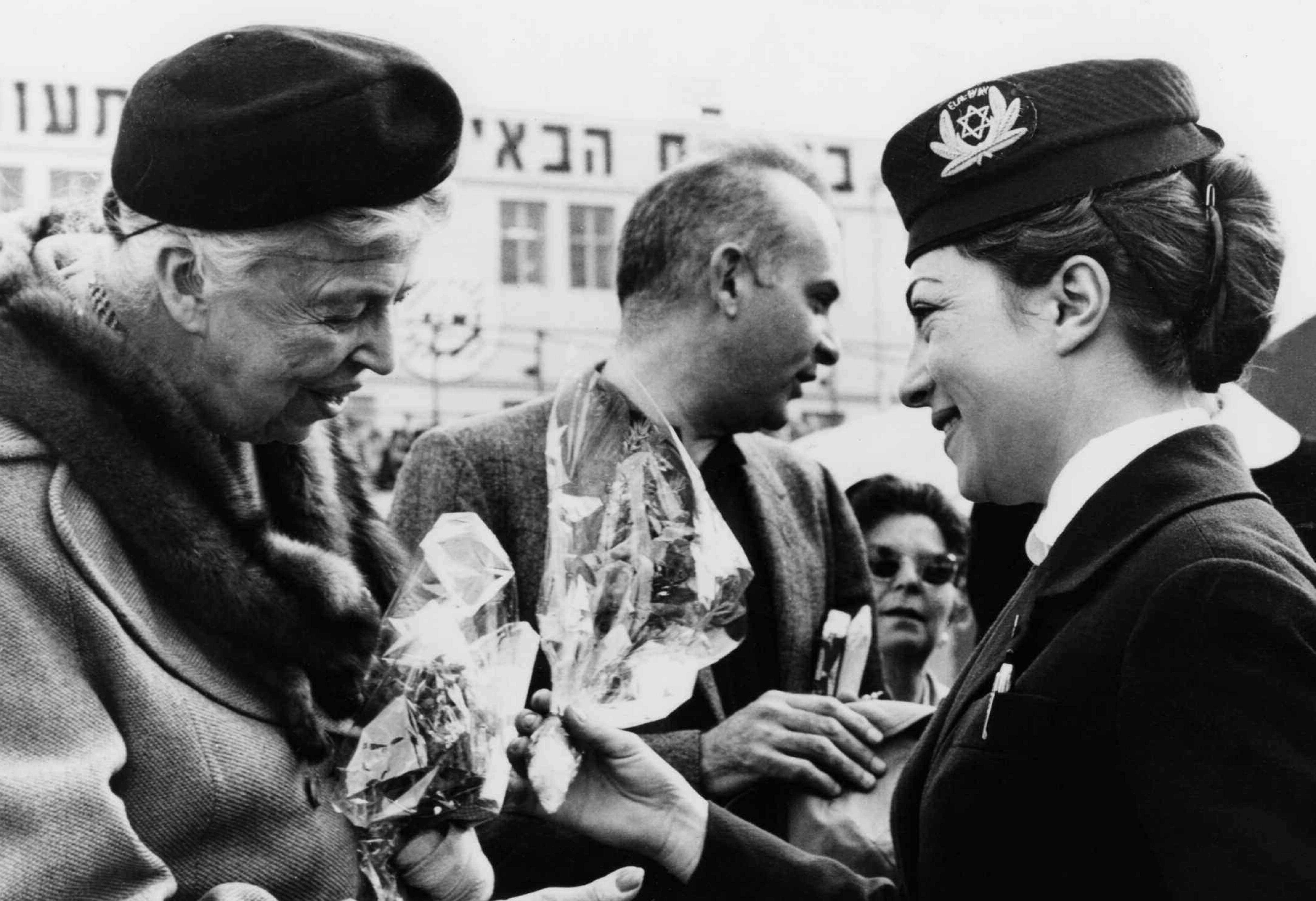
Eleanor Roosevelt, one of the many well known international visitors carried on EL AL, is greeted by an EL AL hostess upon arrival at Lod (now Ben Gurion) Airport, about 1958.