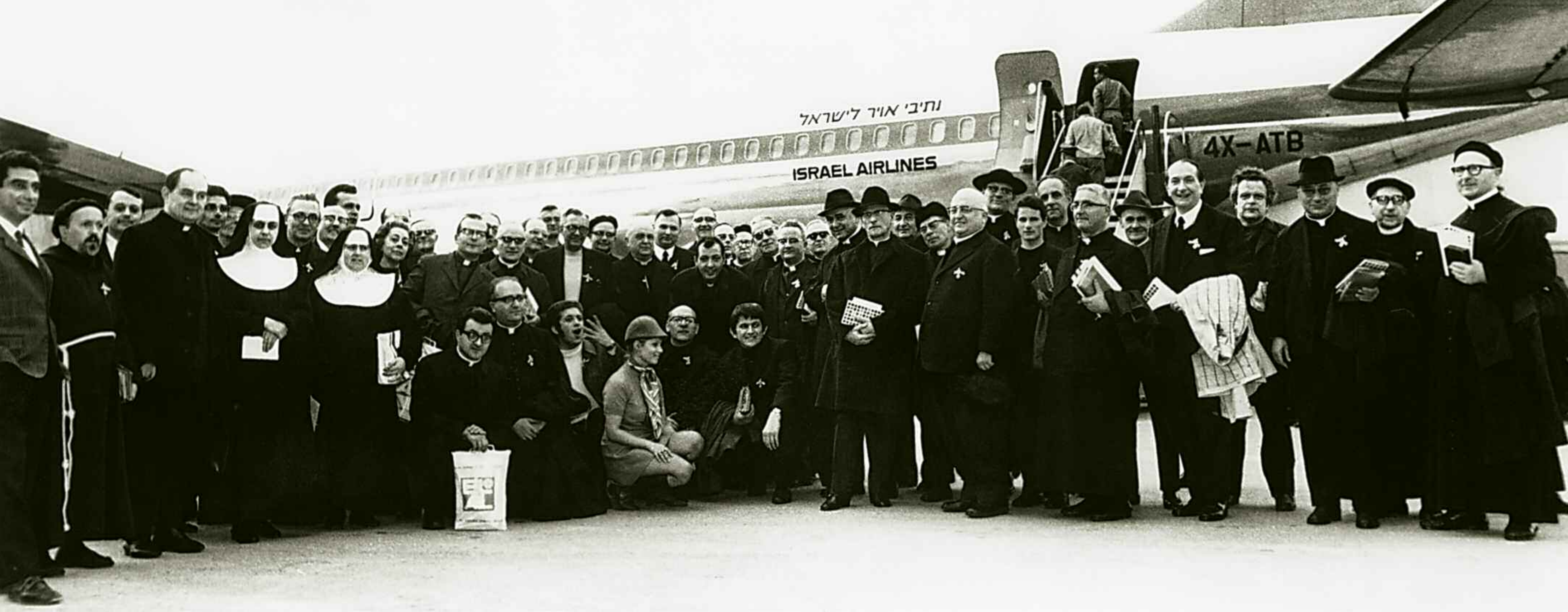
Israel is a popular destination for Christians making a pilgrimage to the Holy Land. Shown is a group of Christian clergy from Europe upon arrival at Lod (Ben Gurion) Airport, in the late 1960s.