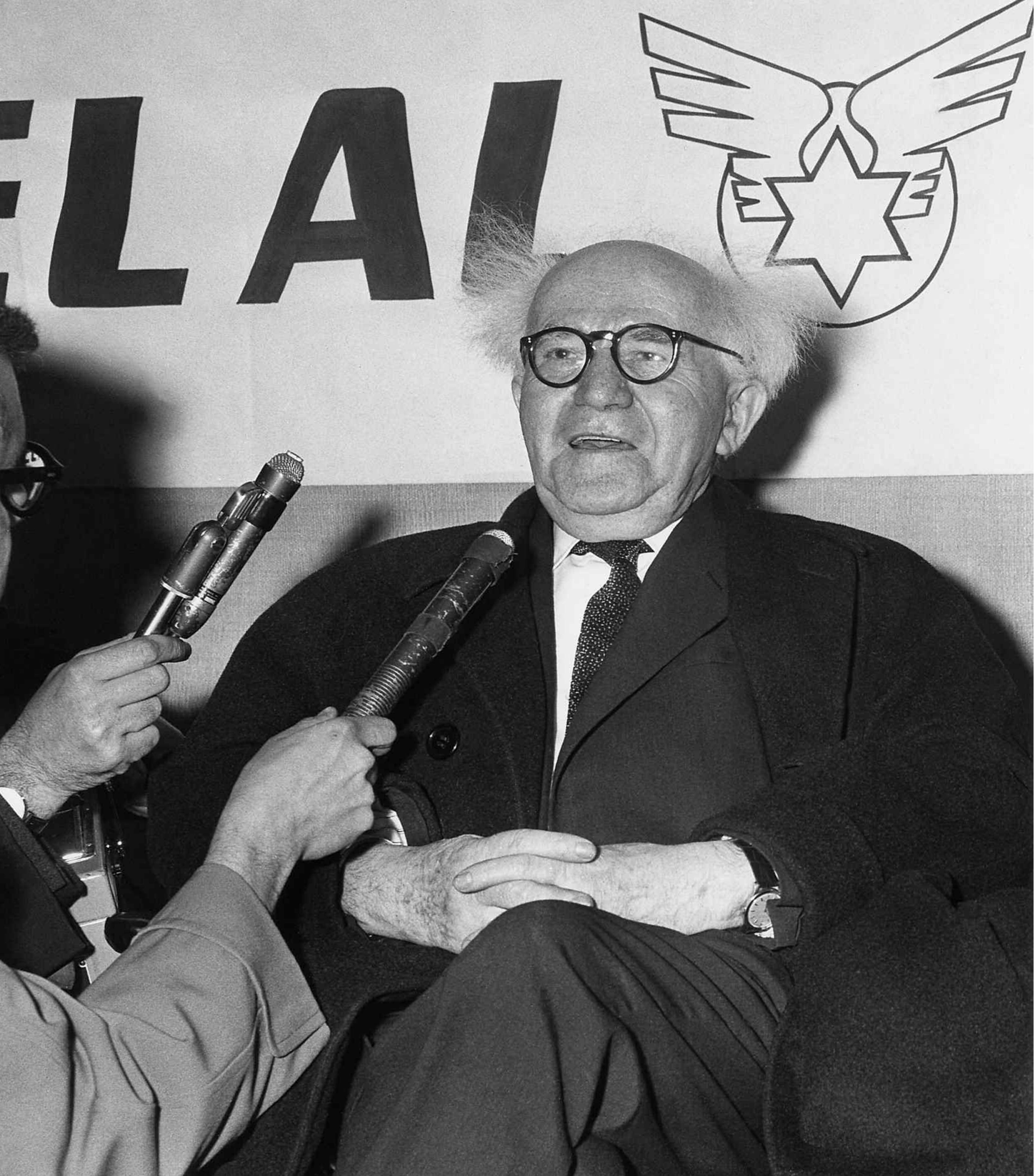
David Ben Gurion, former Prime Minister of Israel and one of EL AL's most frequent travelers, gives an interview in New York following one of his many trips on EL AL, 1960. Ben Gurion Airport (formerly 'Lydda' or 'Lod') is named in his memory.